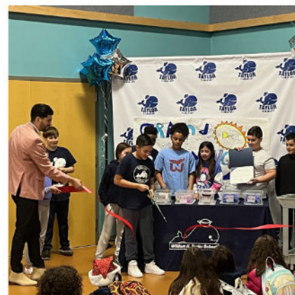
Grand Opening/ Ribbon Cutting Taylor Elementary School Store New Bedford, MA