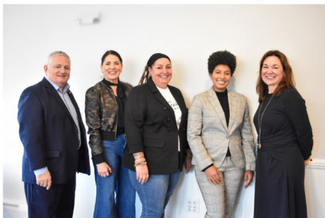
Women-Owned Business Panel Fall River Country Club Fall River, MA