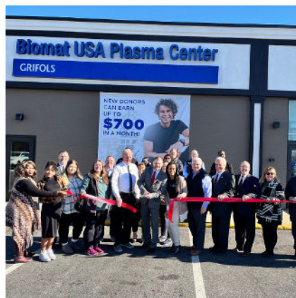
Grand Opening/ Ribbon Cutting Biomat USA Fall River, MA