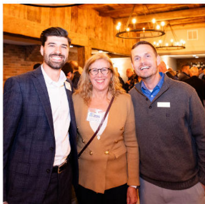
Business After Hours The Rookery Pub Swansea, MA