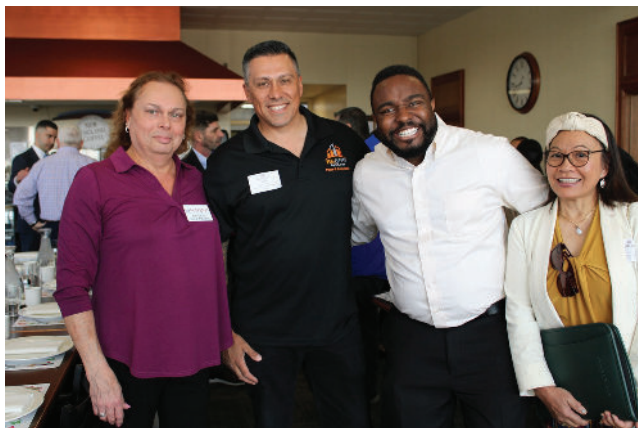
Business Builders Breakfast Diman Regional Vocational Technical HS Fall River, MA