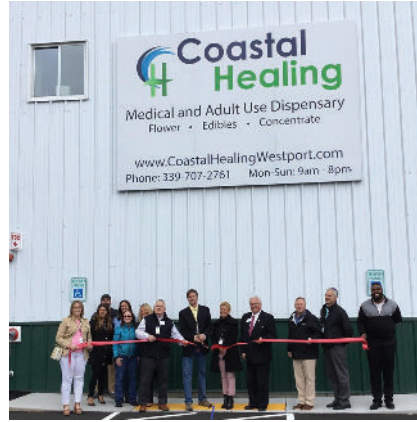
Grand Opening/ Ribbon Cutting Coastal Healing Westport, MA