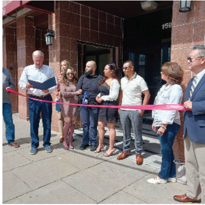
Grand Opening/ Ribbon Cutting Origen Bar & Grill Fall River, MA