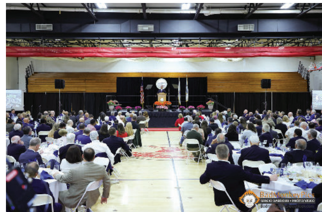
New Bedford State of the City with Mayor Jon Mitchell New Bedford High School