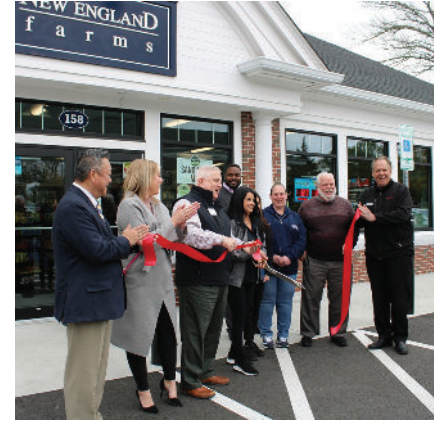
Grand Opening/ Ribbon Cutting New England Farms Acushnet, MA