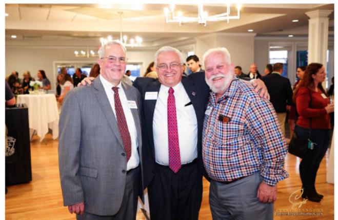
Business After Hours Fall River Country Club Fall River, MA