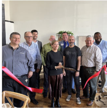
Grand Opening/ Ribbon Cutting High Vibrations Home New Bedford, MA