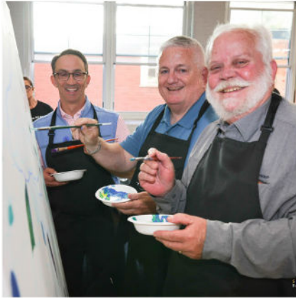
Business After Hours Hatch Street Studios New Bedford, MA