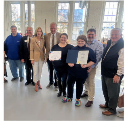
Grand Opening/ Ribbon Cutting SoCo Art Labs Fall River, MA